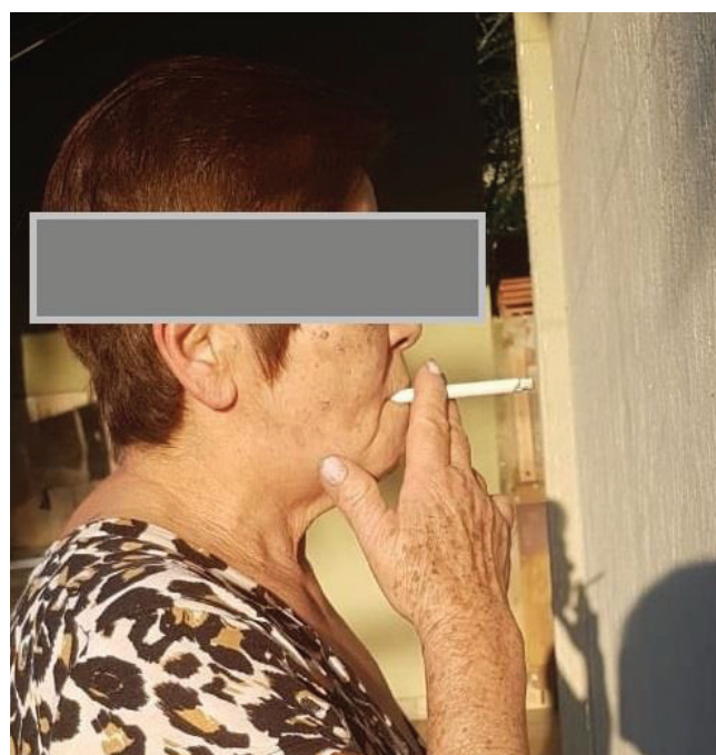
Figure 1. 'Cue Restricted Smoking' position

The primary outcome of the study was continuous